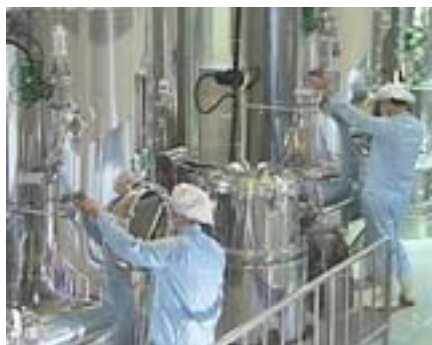
Extraction and granulation are performed in sealed, temperature-controlled, clean rooms

Our herbs are extracted in sealed, temperature-controlled, clean rooms. The only water that is used in extraction processes has been softened and purified to high standards. Our herbs are not subjected to heavy metals from tap water, or to industrial solvents such as acetone or hexane, which are used by some manufacturers to extract one specific standardized active ingredient.