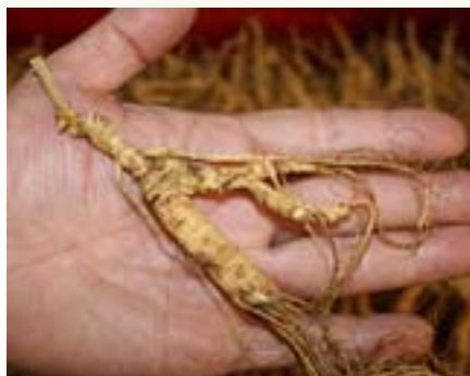
Ginseng, best from Jilin Province in China

We take geo-authenticity seriously. This means we obtain herbs that are indigenous to a specific region, and when grown there will yield the best medicinal results. For example, Chuan Bei Mu (Bulbus Fritillariae) should be grown in the Sichuan province for the best results, as the soil and climate of Sichuan produce the highest development of its therapeutic components. In addition, we select the appropriate therapeutic portion(s) of the plant and pay careful attention to the method and timing of harvesting, in order to maximize and preserve their effectiveness.